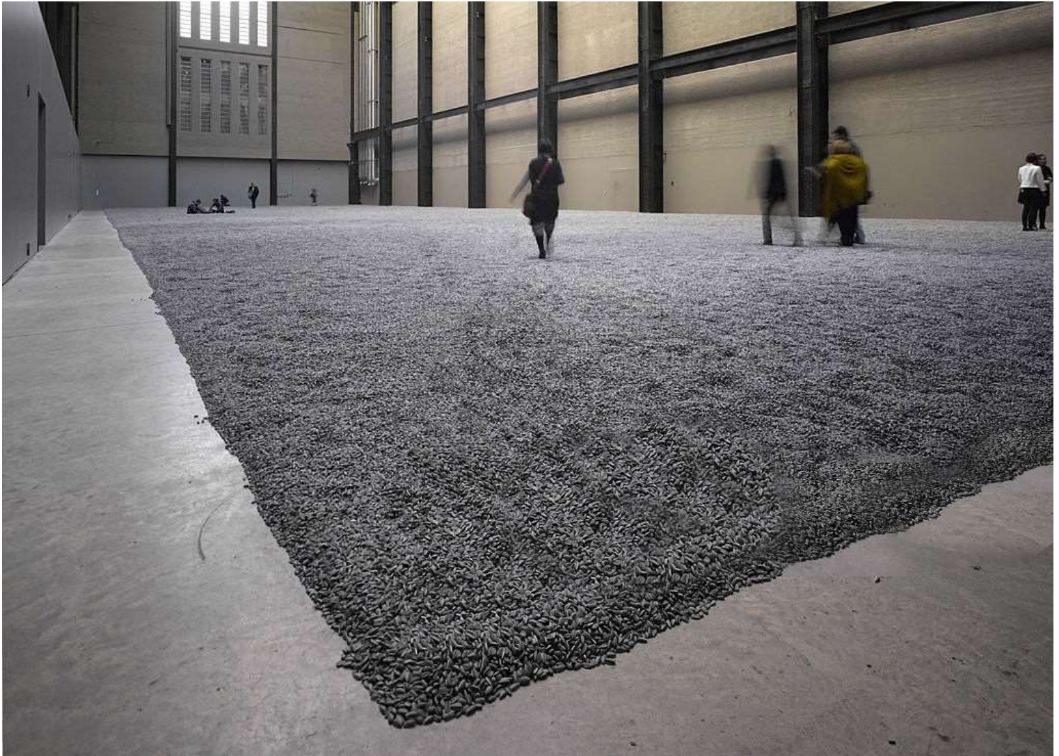
“Sunflower Seeds”, handmade and hand-painted porcelain (approximately 8 million); Installation, Ai Weiwei, Tate Gallery, London, 2010.

“Ideas alone can be works of art; they are in a chain of development that may eventually find some form. All ideas need not be made physical....All of the significant art of today stems from Conceptual art. This includes the art of installation, political, feminist, and socially directed art”