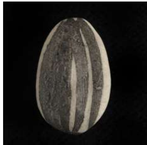
Porcelain Sunflower Seed, Ai Weiwei, 2010